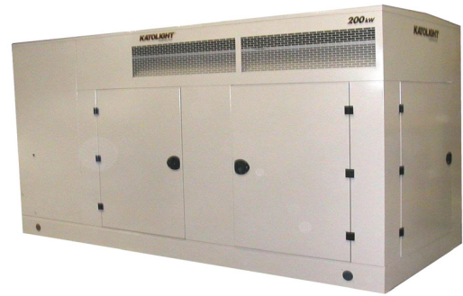
Crystal Quiet Enclosure