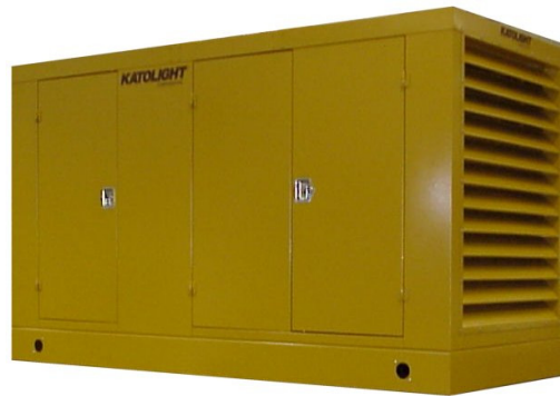
Weather Proof Enclosure

Katolight enclosures are designed to meet a wide variety of engine generator applications. From harsh environmental conditions to extreme sound attenuation needs, these rugged enclosures are built with longevity in mind and are manufactured from steel, galvaneal, stainless steel or aluminum. The standard colors are Katolight tan or gold. Custom colors are available. A Katolight enclosure will protect the entire power system.